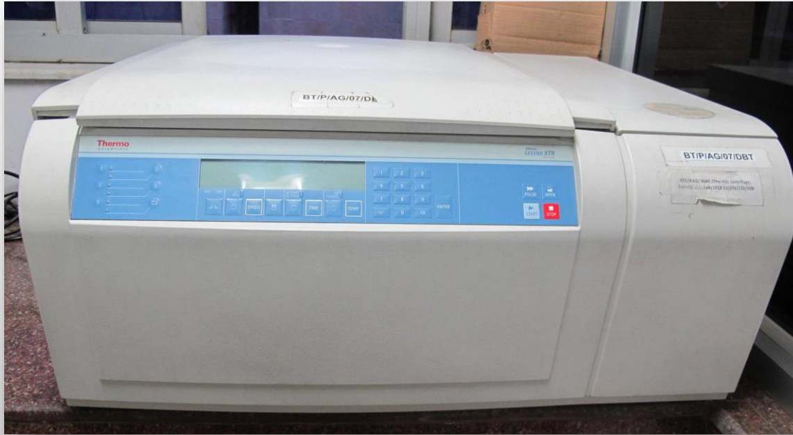
Refrigerated Centrifuge (Thermo, Sorvall XTR)