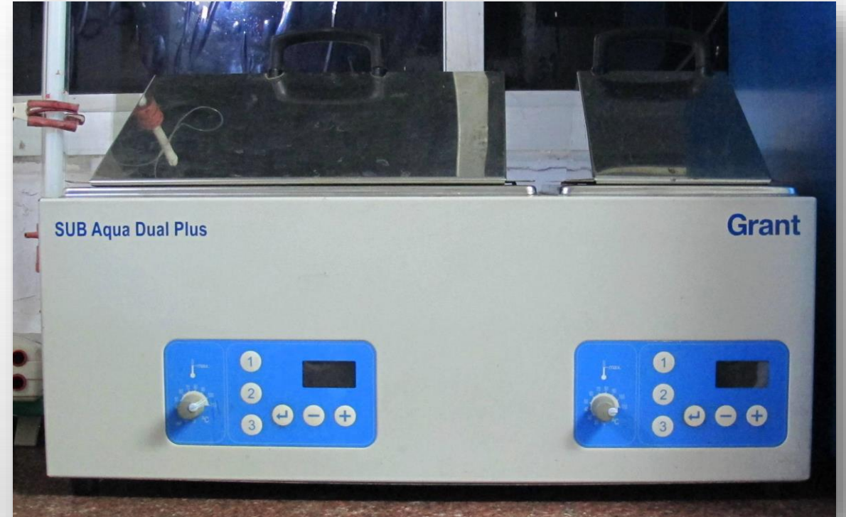
Twin Hot water bath