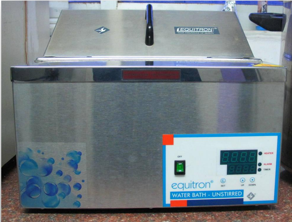
Hot water bath