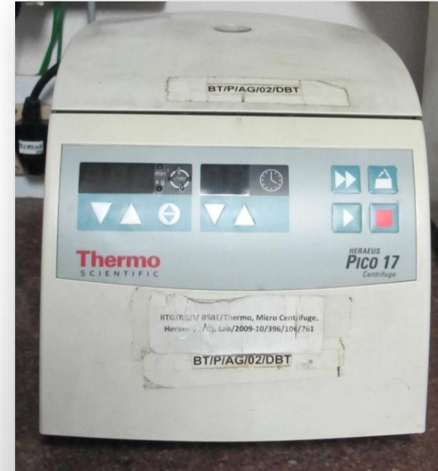
Centrifuge (Heraeus Pico 17)