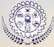
MIT Quest for Excellence Marathwada Institute of Technology, Aurangabad