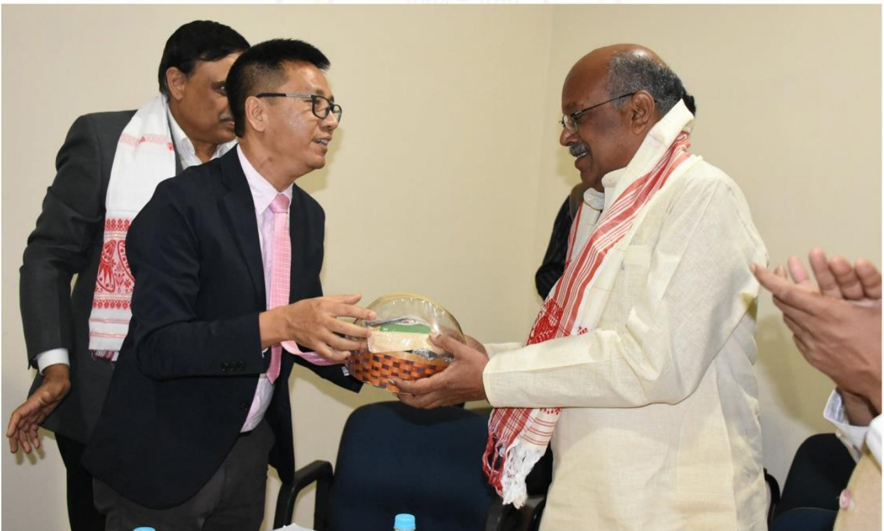
Hon'ble Minister of State for Human Resource Development visits Technology Incubation Centre, IIT Guwahati