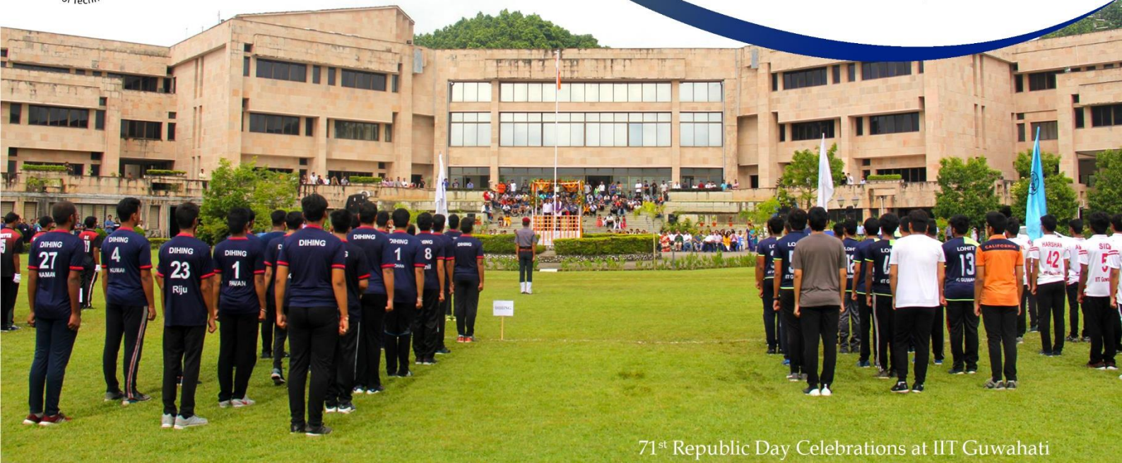
71 st Republic Day Celebrations at IIT Guwahati

The Monthly Newsletter of IIT Guwahati Volume II, Issue I, January 2020