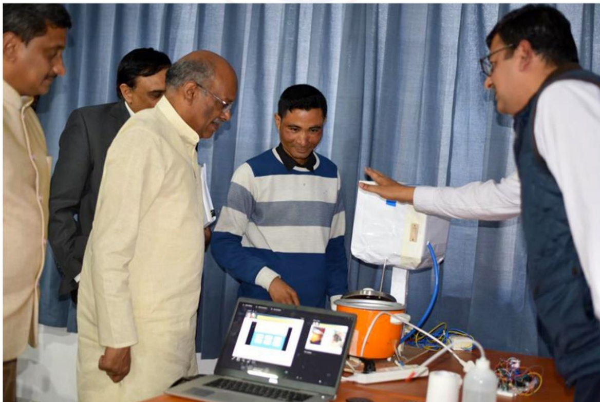
Hon'ble Minister of State for Human Resource Development visits Nanotechnology, IIT Guwahati