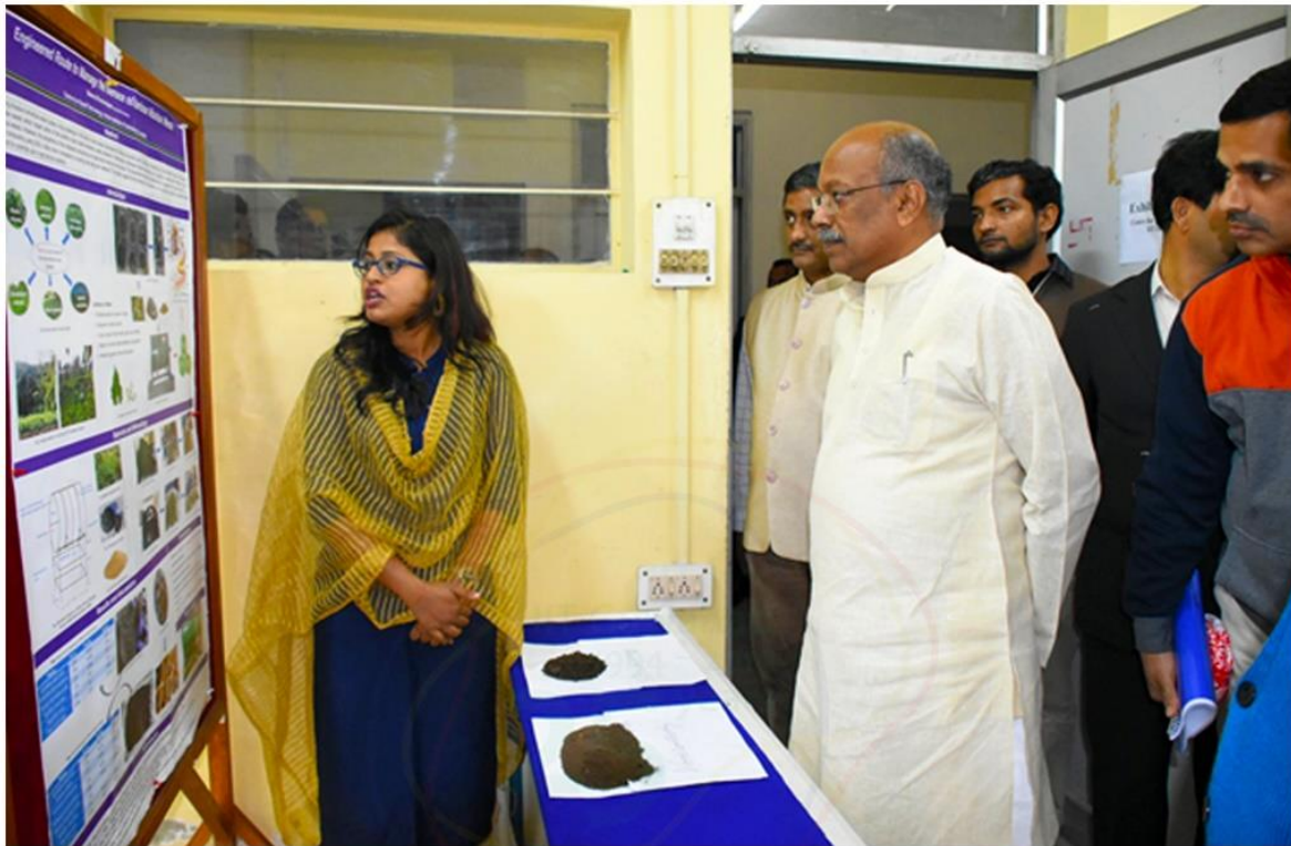
Hon'ble Minister of State for Human Resource Development visits Centre for Rural Technology, IIT Guwahati

The visit of Hon'ble MoS ended with an address to the Director, Deans & Associate Deans, Registrar, Heads of various Departments and Centers and Officers of the institute.