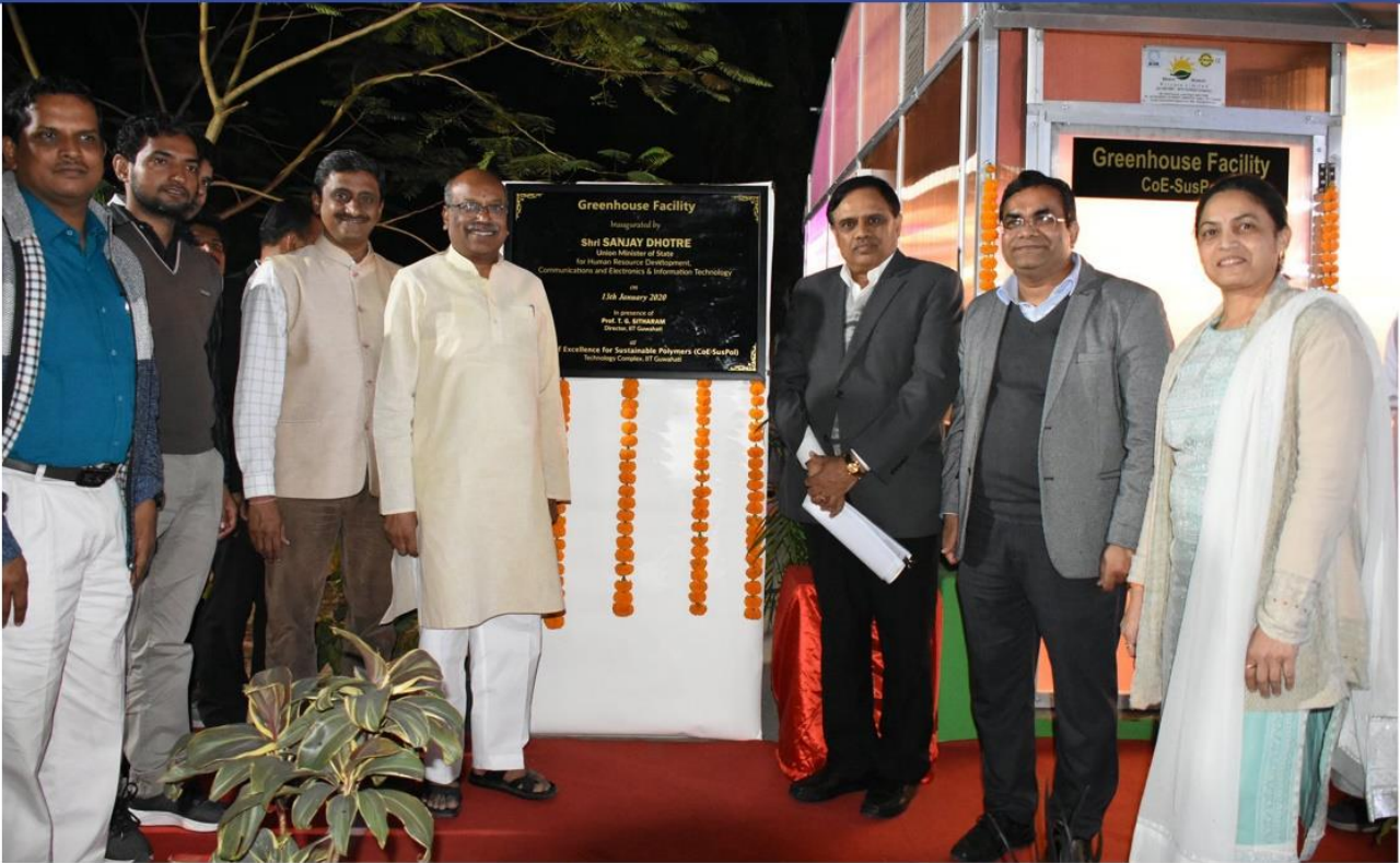
Hon'ble Minister of State for Human Resource Development & Director IITG Inaugurate Centre of Excellence for Sustainable Polymers (CoE-SusPol)