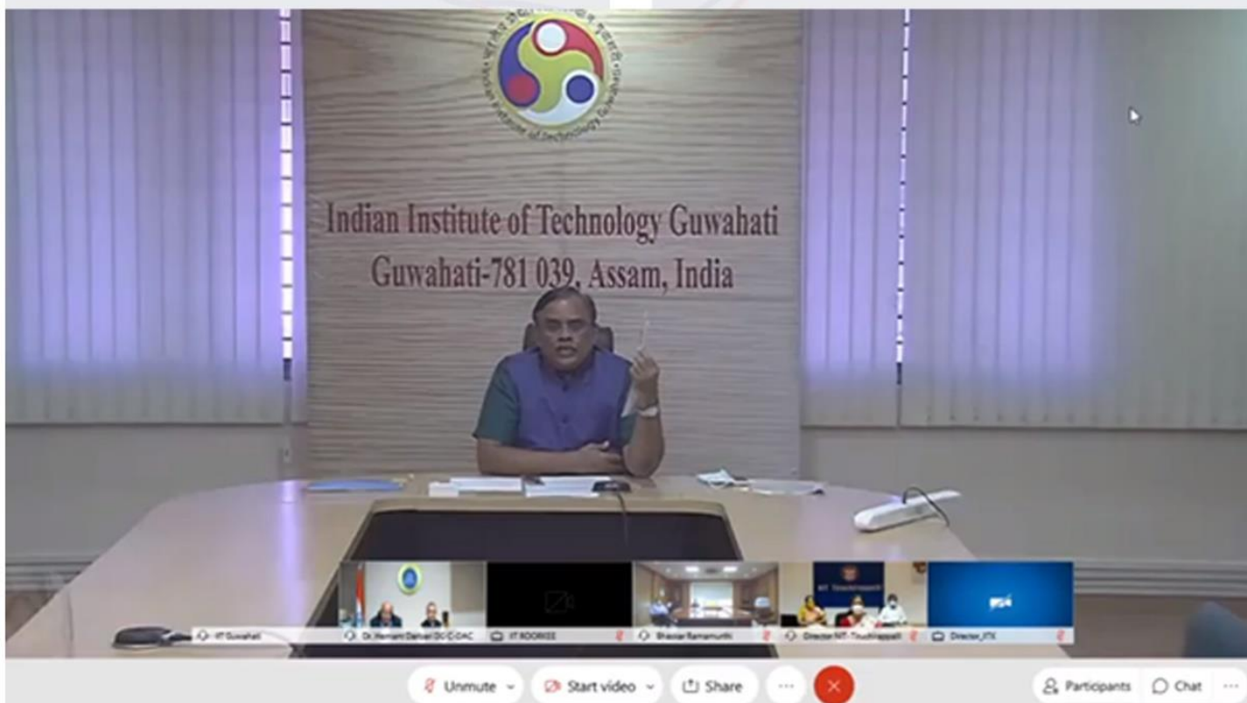
Prof. T.G. Sitharam, Director, IIT Guwahati, during the virtual event for signing the MoU with C-DAC, Pune

C-DAC, Pune, will install the Supercomputing facility using the building approach of NSM in IIT Guwahati, which will provide necessary Data Centre space, power with back up, cooling, etc. for the facility. This new hybrid Supercomputing system will not only boost the HPC usages and research environment in the Institute but also enhance the research capability of the Northeast Region.