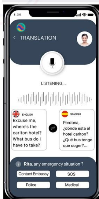
Screenshot translation and Emergency

Considering the operational benefits it can provide and its mission to convert every offline business to online, Sahara app has been launched and is available on the Google Play store.