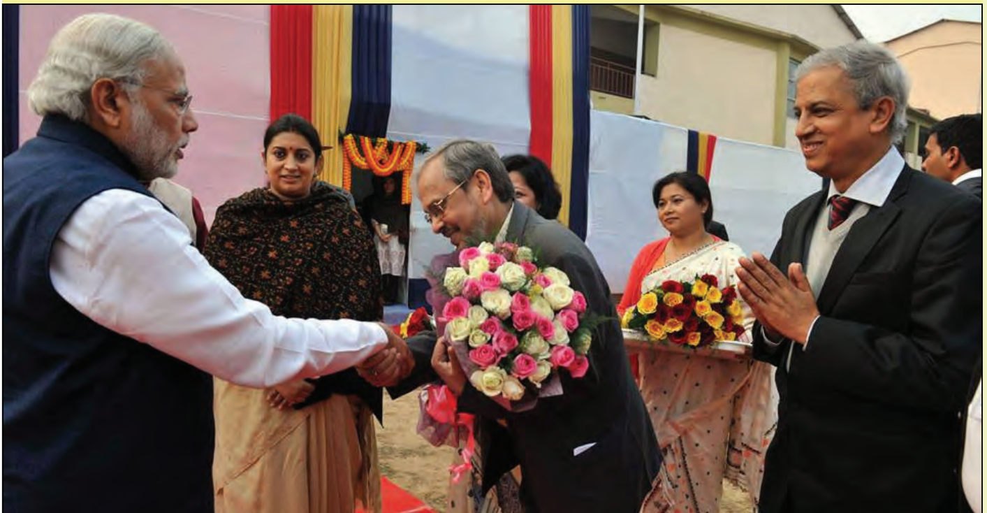
The Hon'ble Prime Minister, Shri Narendra Modi being welcomed at IIT Guwahati at the foundation stone laying ceremony of new campus of IIT Guwahati on January 19, 2016.