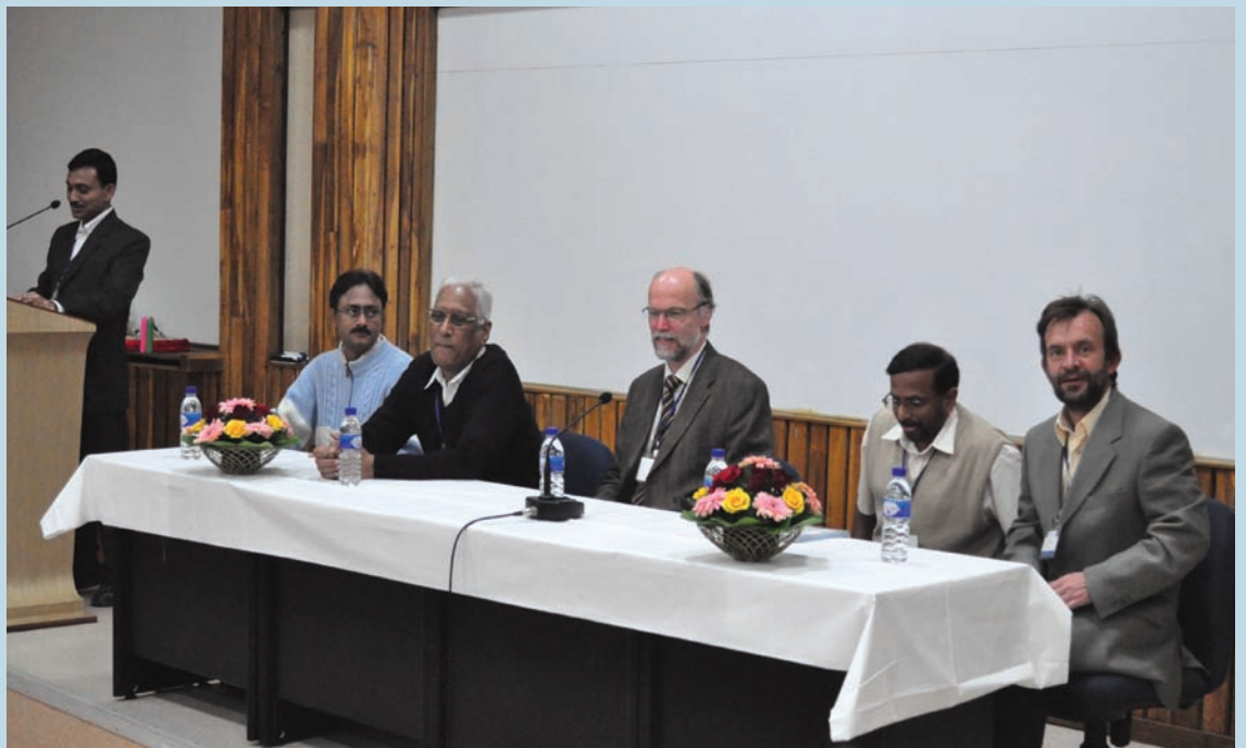
Invited scholars on the dias, at the inaugural function