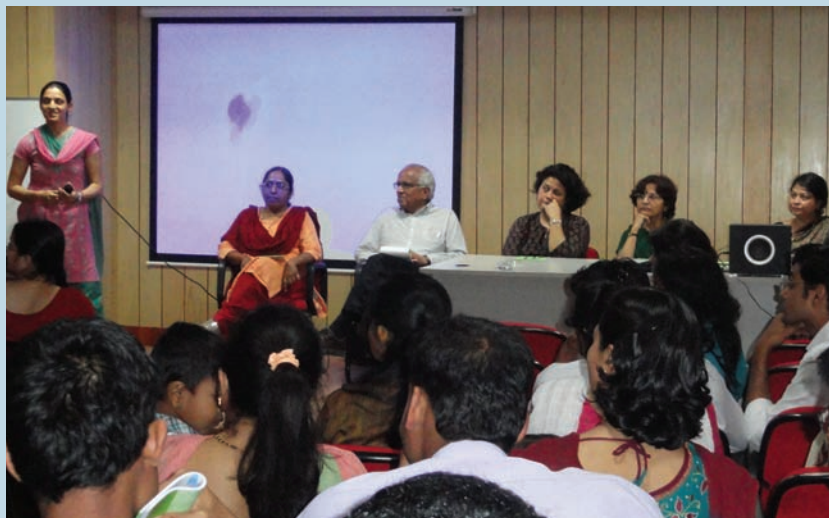
Delegates, resource persons and participants at the programme

On the occasion of the International Women's Day 2011, a short programme on Women Empowerment and Health was organised in the Seminar Hall of the Department of Humanities and Social Science on 8 March 2011. A panel discussion was held on topics related to empowerment of women, various cultural and social issues faced by Indian women, equality among the genders and health awareness among the working women, and was attended by scholars of the Institute.