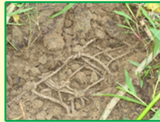
Layers of plastic net