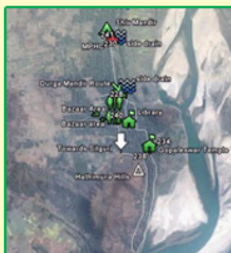
Area with no drainage

Lack of long term drainage planning with due consideration to social need, climate change and future development is the prime cause of urban flooding. Therefore, we are emphasizing proper drainage in semi-urban area, as implementation of an adequate drainage in a later stage become much difficult. With support of local people from Bamundi and with a formal request from their Gaon Panchayat detail drainage planning was made. The plan is yet to be implemented due to fund constraints.